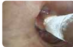
Cryobiopsy with high diagnostic weight